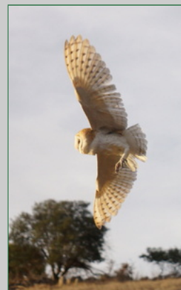
In India, Two Brothers Are Saving Black Kites from a Surprising Foe: Paper Kites , Audubon.org , 01 Feb 2017